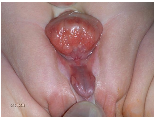
Figure 1 Male baby with classical bladder exstrophy.

Exstrophy variants include a clinically inhomogeneous spectrum. The covered exstrophy appears similar to the CEB, just some part of the reddish bladder mucosa may have a roof of skin, for instance. An umbilicus might be at an orthotopic place. Pseudo-exstrophy, however, may be very difficult to define after birth and is therefore often found at older ages. The genitalia look normal, the patients may not have any urinary symptoms and furthermore are completely continent. Clinical inspection may