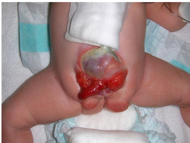
Figure 5 Male newborn with cloacal bladder exstrophy.