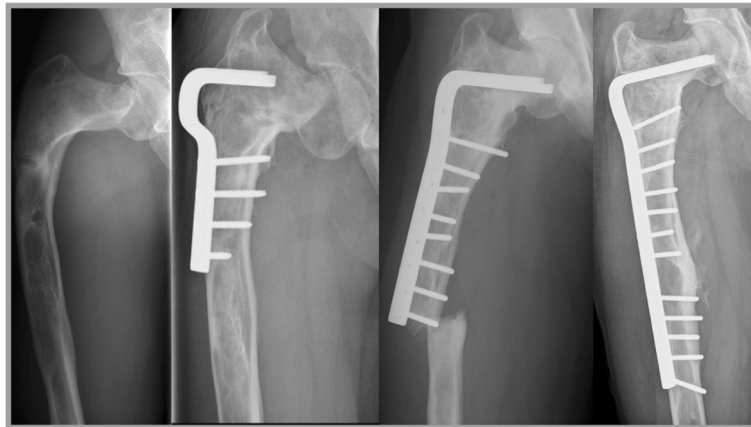
Fig. 1 Structural failure after angled blade plate endoprosthesis. The first patient that needed revision surgery (ID 7) was a male with shepherd's crook deformity of the femur and was previously treated elsewhere for a pathological femoral fracture by means of a valgus osteotomy combined with a short angled blade plate (Fig. 1). The coxa vara persisted however (FNSA 67^\circ ), associated with severe pain complaints for which he was referred to the LUMC, 8 years after his first surgery. A subtrochanteric osteotomy was performed and fixation was undertaken using a larger blade plate and a temporary external fixator, which resulted in improvement of the coxa vara (FNSA 97^\circ ) and good functional outcome. Pain was adequately controlled with additional bisphosphonate therapy. Four years later the patient unfortunately sustained a fracture of the femoral diaphysis, distal to the angled blade plate. This part of the femur was also affected with fibrous dysplasia and together with the stress riser of the distal angled blade plate formed a weak location in the femur, prone to fracturing. The angled blade plate was removed and a longer angled blade plate was inserted to cover the whole area of the affected femur. This procedure was followed by a good functional outcome and disappearance of pain symptoms lasting to the end of follow up

Historically, fibrous dysplasia lesions of the proximal femur were treated by curetting the lesion, with or