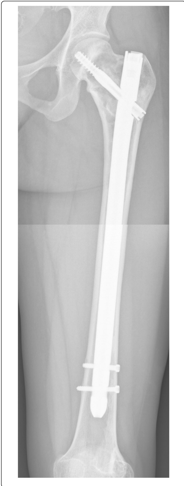
Fig. 3 Customized intramedullary nail. A customized intramedullary nail with a HA-coated proximal screw was used in one patient (ID 18), in order to ensure ingrowth in the femoral neck. The nail had an enlarged diameter because this particular patient had severe cortical thinning throughout the length of the femur, providing insufficient structural support for a standard sized intramedullary nail

cortex to be milled out to ensure submerging of the plate into the bone. In the MUG, removal of the hardware in patients with complaints of the iliotibial tract resulted in good functional outcome in all with no reported (new) pathological fractures. Notwithstanding these outcomes may have also be due to the fact that these cases had mild fibrous dysplasia and it is likely that the femur in more severe types of fibrous dysplasia may not be so forgiving after removal of any form of supporting hardware. Based on published literature and data from our combined cohort we can conclude that angled blade plates can be effectively and safely used in fibrous dysplasia of the proximal femur, providing that the lesion can be adequately bridged by the implant with proximal and distal locking of the angled blade plate into healthy bone. Based on the LUMC experience, we also recommend that the surgeon should ensure submerging of the plate into the bone, as this appears to prevent complaints of the iliotibial tract.